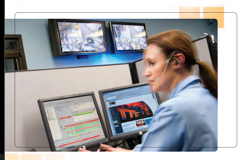
A home security system is your personal, 24-hour sentry. It's always on duty, always vigilant, and always ready to sound an alarm at the first sign of danger.

While some homeowners ask about a freestanding security system, you create a vastly increased level of security by having your system monitored via a communication link. When there's an alarm, your system will alert our monitoring station to dispatch the appropriate emergency responders.