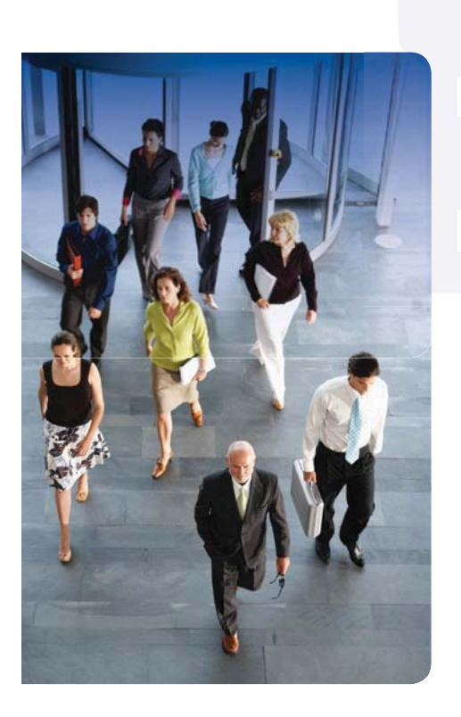
HID Global's EasyLobby Secure Visitor Management (SVM) solution is the secure and professional approach to identify, manage and track visitors in your buildings.