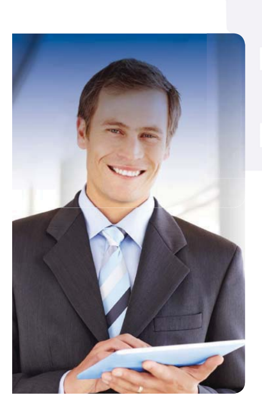
eKiosk runs on Windows*, Apple* iPad or Android* tablet computers and allows visitors to use a familiar touch screen interface to quickly register, print out their own badges upon check in and notify your employees or tenants of their arrival.